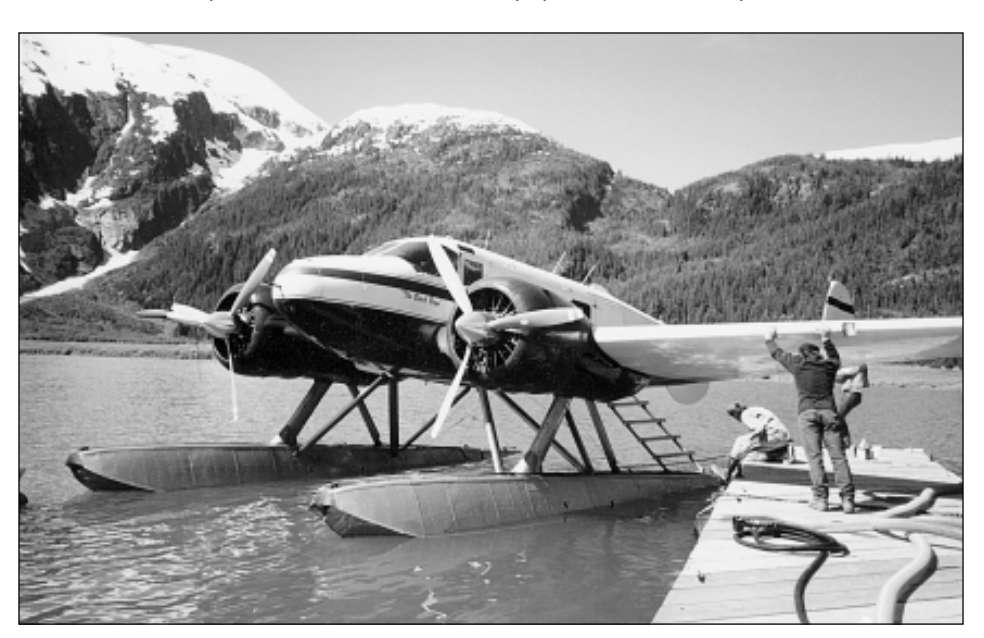
Sockeye salmon fry get a free ride to Sweetheart Lake.

Sweetheart Lake is one way DIPAC is working to support personal use fishermen, common property fisheries both commercial and sport, and of course, the bear population can't complain either.