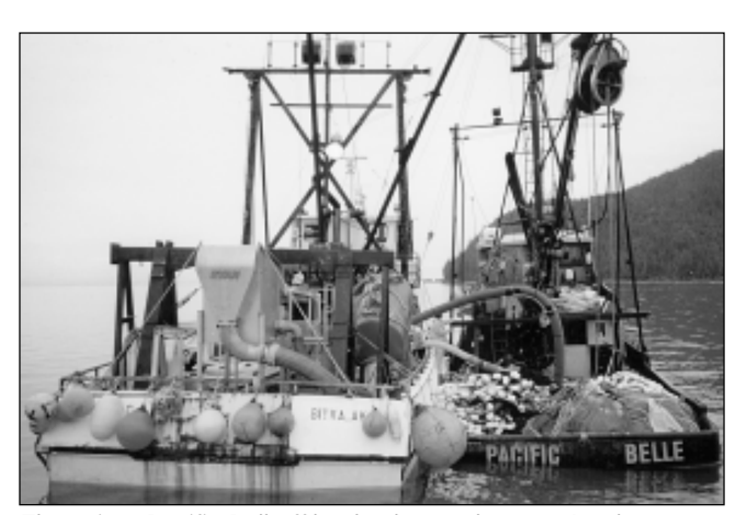
The seiner Pacific Bell off-loads chum salmon at Amalga Harbor.

Egg take operations used 158,000 chums for brood stock to reach the goal